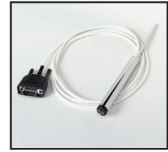
optional x50 Headstage Probe

Optional headstages are available for use with high impedance electrodes. Typically, they are recommended when the impedance of the electrode exceeds 1 to 2 megohms. The headstage supports all instrument functionality, including record, stimulate and impedance modes. When configured for use with a headstage, all recordings are differential. Monopolar recordings can be made by shorting the reference input. Headstage cable length is 5 feet, but can be extended up to 10 feet long.